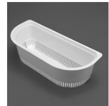
AC18 'D' Colander