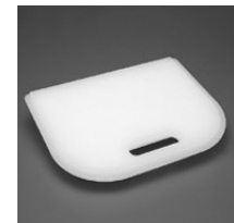
AC25 Synthetic Preparation Board